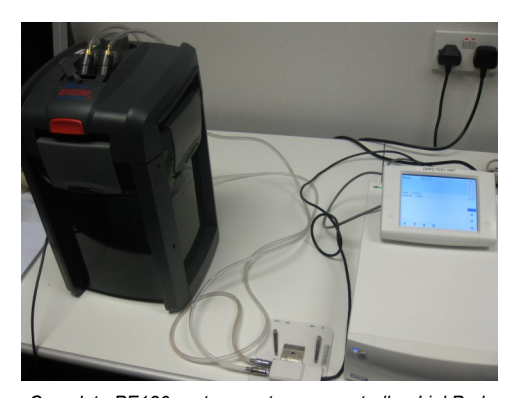
Complete PE120 system— stage, controller, LinkPad and ECP water pump in the Lab