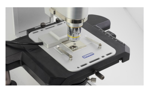
The PE120 heating and freezing stage

PE120-XY System — To fit XY tables with 160mm x 110mm recess, or can be used on the top surface of XY tables without recess, with the optical axis at 81.9mm from rear edge of the PE120 stage (74mm from the centres of the slide-holder holes).